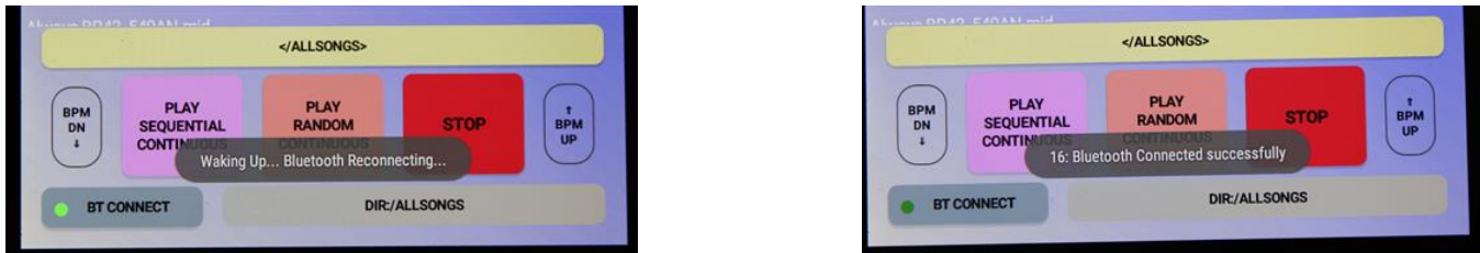
Tablet waking and automatically reconnecting

Also, it may take one song cycle (one song finish playing, and then the next song) to see the currently playing song refreshed on the tablet selection bar.