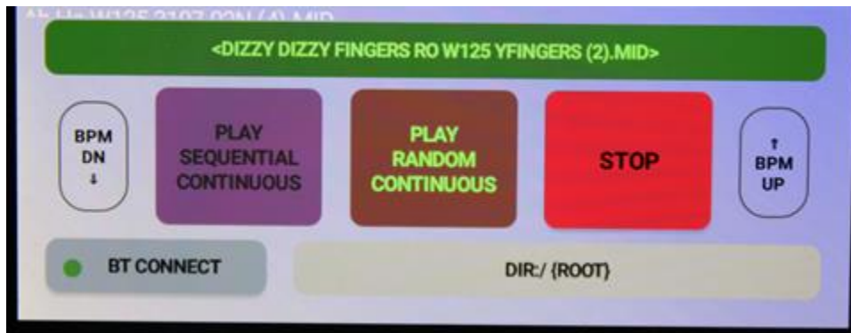
Play Continuous Random – the currently playing song is displayed on the Selection Bar

Besides selecting and playing individual songs, one can press the tablet soft keys PLAY SEQUENTIAL CONTINUOUS , or PLAY RANROM CONTINUOUS . When tapped the playing mode will be indicated with bright green text, and the mMS/MMS hardware will continuously play all files in the current directory until the STOP button is pressed. The song name of each new song that is playing is displayed on the tablet on the Selection Bar. Before each song plays, if a delay is set a countdown to next song play will be indicated.