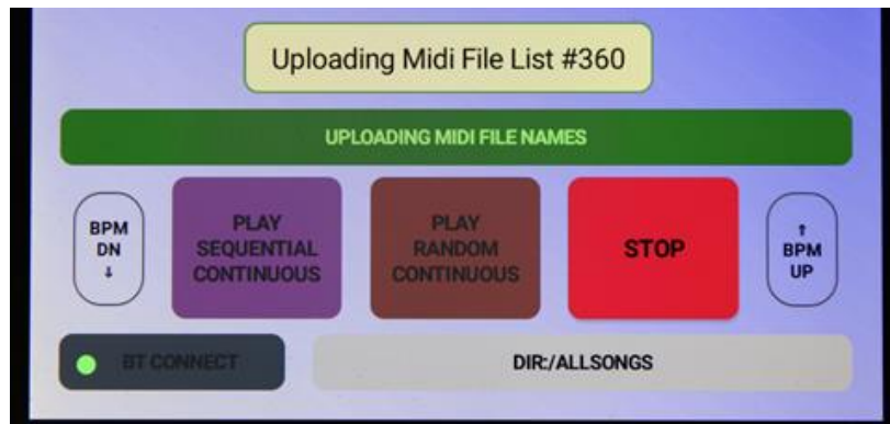
After connecting or changing directories, all mid and playlist filenames are uploaded from the mMS/MMS hardware to the tablet, and a scrolling song list is created

Immediately after selecting the Bluetooth device and establishing connection, all midi and playlist filenames in the default directory, and all directory names in the {/Root} directory are uploaded to the tablet. This happens very quickly at 115k baud. Only the file and directory names are uploaded and not the actual and complete midi song files - only the names . After connecting and automatically uploading the directory and file names, a scrolling list is created on the tablet.