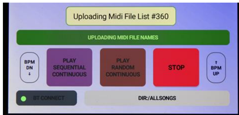
Mega Midi Sequencer Soft-Keys

After the mMS/MMS App on the tablet is running (by tapping on it on the Tablet home screen), and a connection is made to the mMS/MMS hardware, the following controls, buttons, and displays are available.